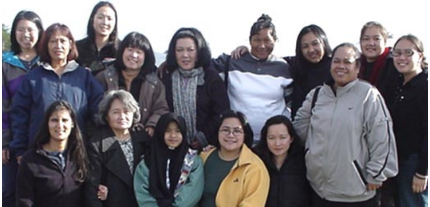
APIWHANN Retreat participants

APIWHANN steering committee felt this retreat provided a new beginning that brought members to a common understanding of APIWHANN's history, mission and direction. Some future activities include participating in A&PI Wellness Center's A&PI Women's Wellness Day on March 8, International Women's Day; a skills-building workshop at APIAHF's "VOICES: From the Community" conference from April 27-29, and finalizing the APIWHANN's re-search study.