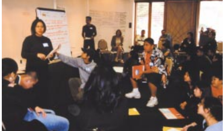
Youth & providers collaborating in a break-out session.

continued from pg.1 "Meeting at the Crossroads"